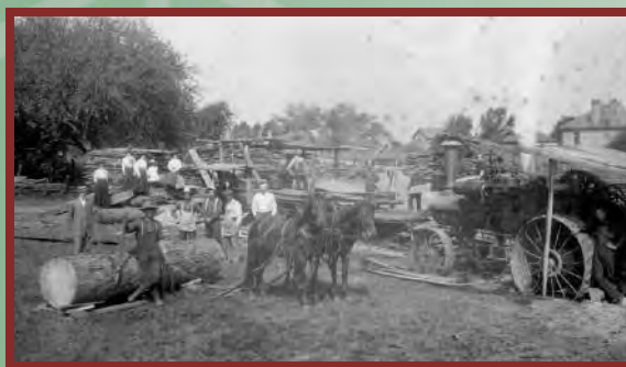
During the course of the research, intriguing mystery photos were unearthed by the East Nissouri committee. Pictured here is a turn-of-the-century portable sawmill powered by steam engine somewhere near Kintore.

Township book writing projects), a group of dedicated individuals have been tirelessly searching through mounds of historic archives in the Registry Office, researching mountains of documents, trying to ascertain sources and timelines of mystery photos, all the while piecing together the story that was East Nissouri.