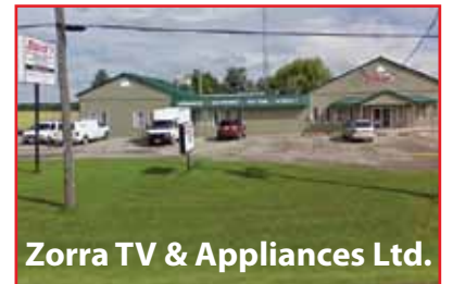
Zorra TV & Appliances Ltd.