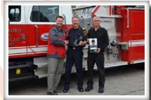
Photo (L to R)