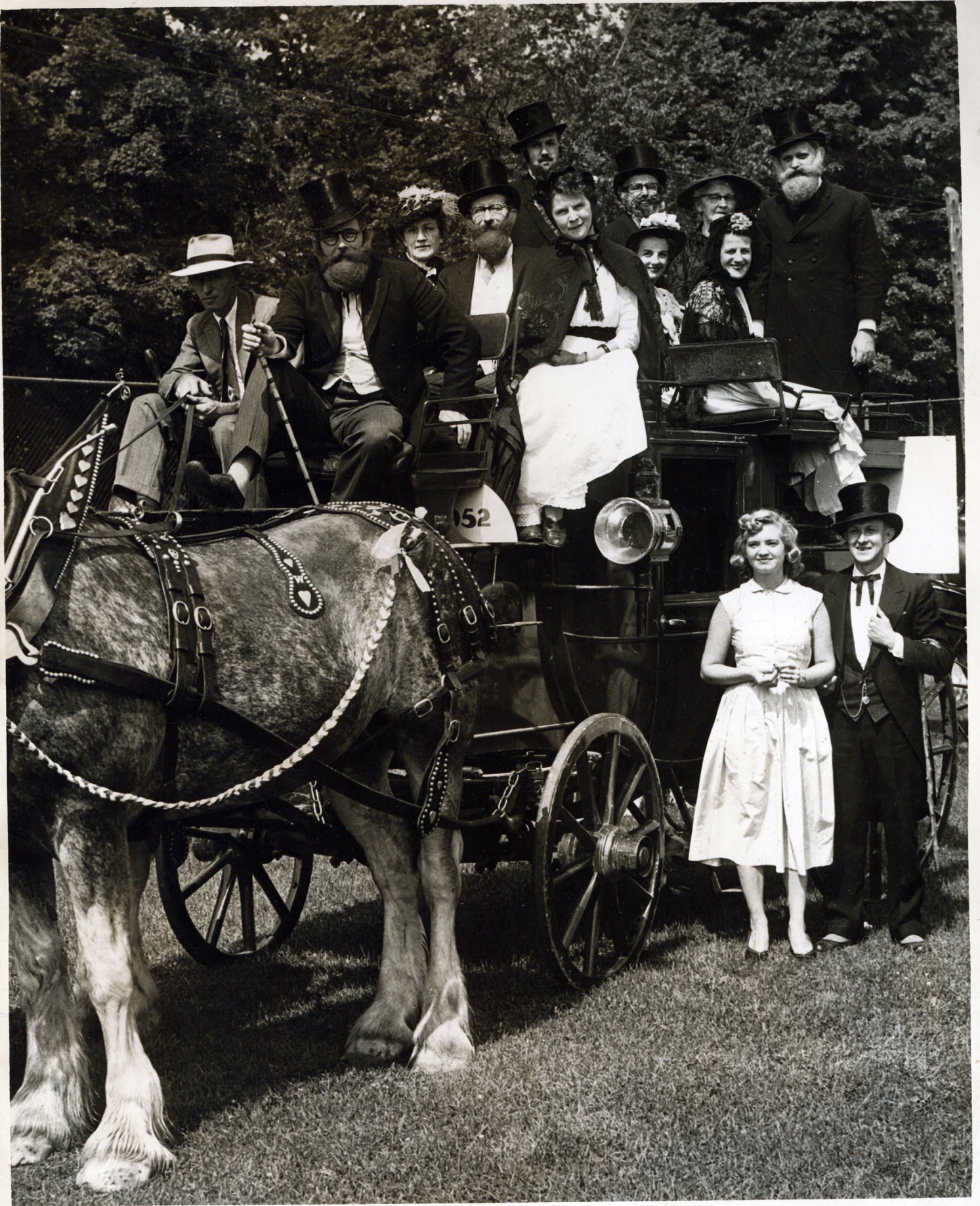
Ingersoll Centennial parade, Stagecoach, 1952 Group depicted in period costume on a horse drawn stagecoach, likely taken in Victoria Park.