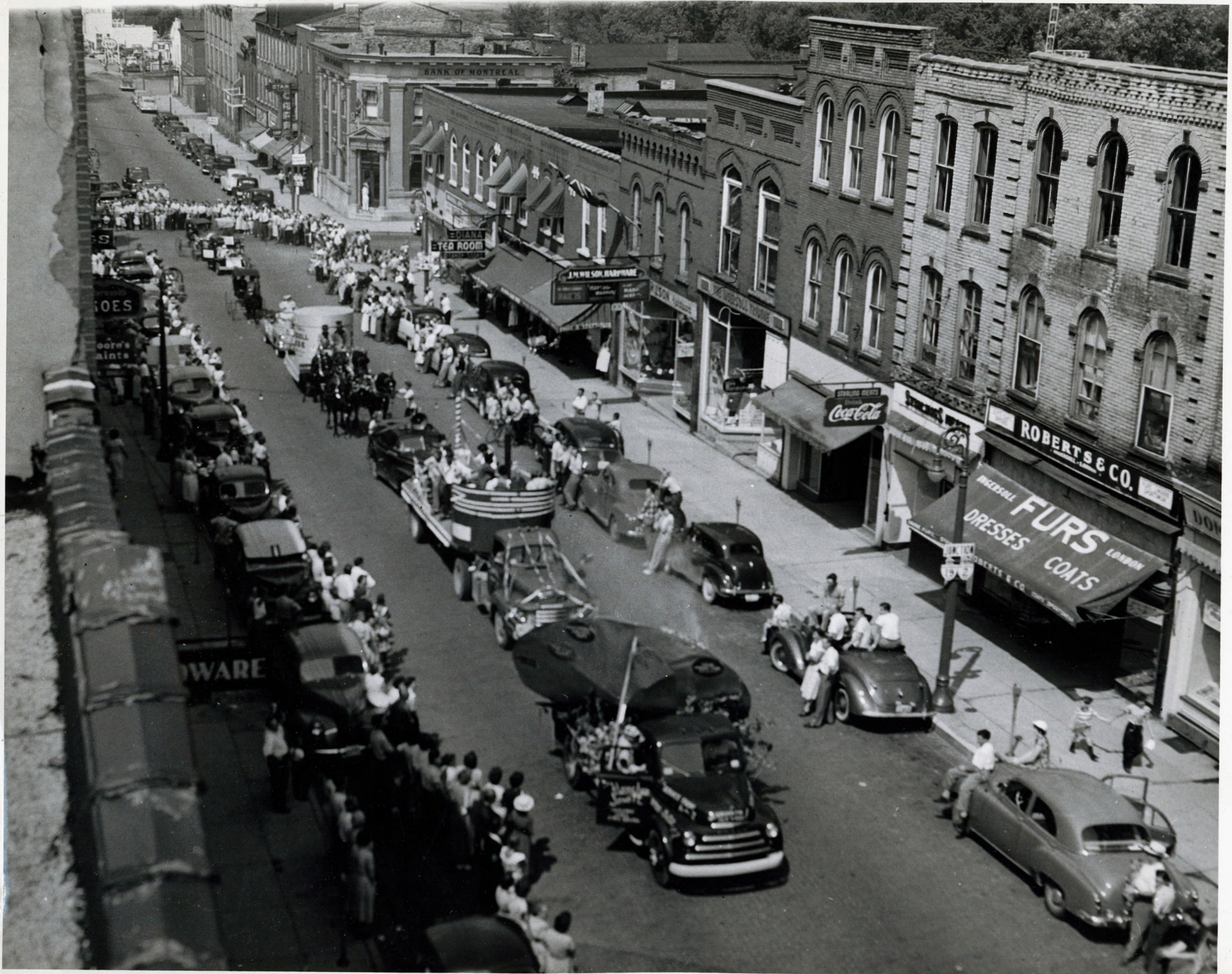
Ingersoll Centennial parade, Thames Street, 1952. Depicts a parade on Thames Street, looking north east. Taken from the vantage point of a roof top. Shown is Star Café, Bank of Montreal, Diana Tea Room, J. M. Wilson Hardware, Tribune office, Sterling Meats, Roberts & Co., Ladies Wear.