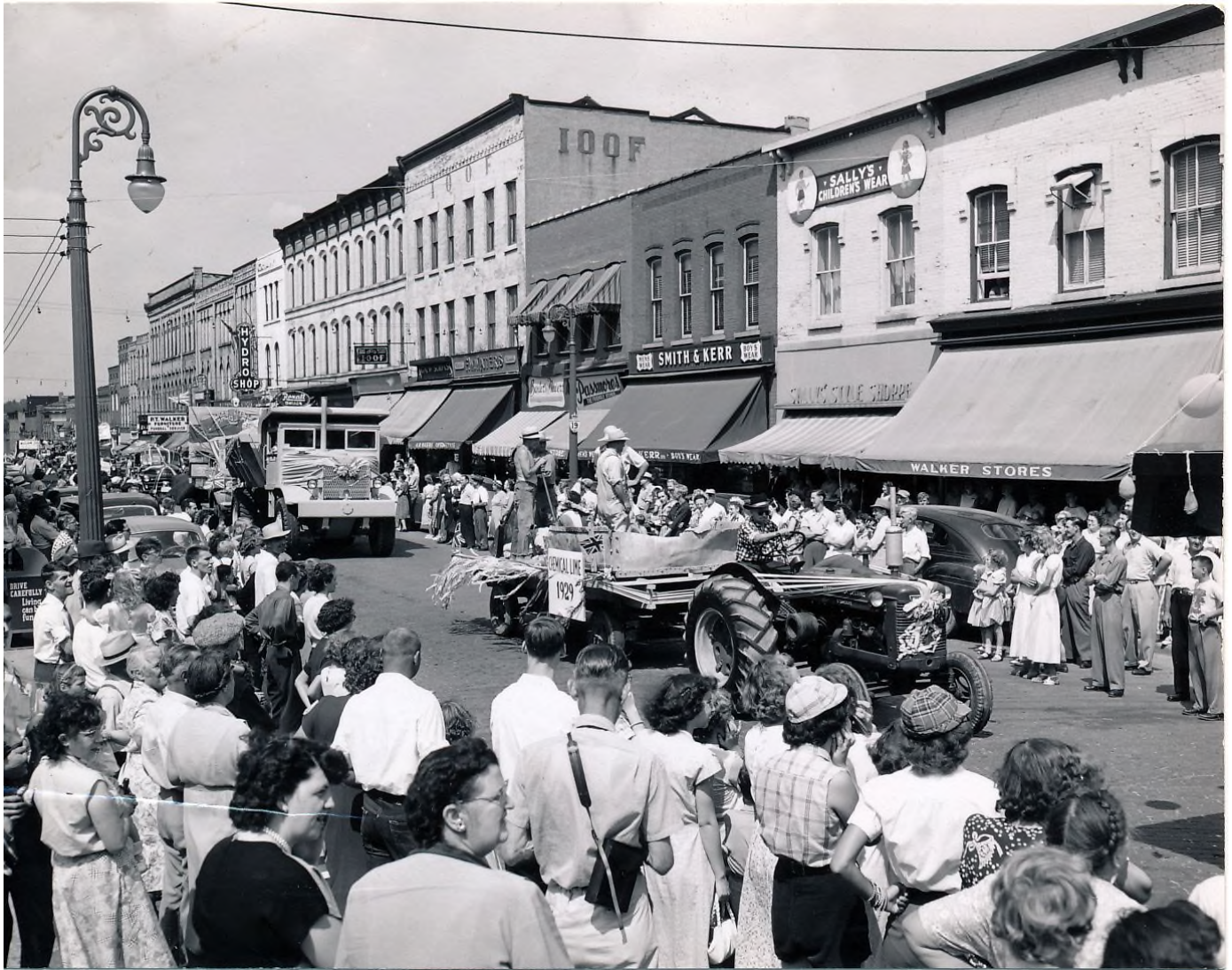
Ingersoll Centennial parade, 1952. Depicts Thames Street looking east from the corner of King Street. Tractor drawn float featuring Chemical Lime 1929; Chemical Lime dump truck. East side of Thames streetscape including: P. T. Walker furniture; Hydro shop; Rexall drugs; IOOF hall; Passmore's; Smith & Kerr Clothing; Sally's Style shop; Walker stores. Decorative street lights, brick paving shown.