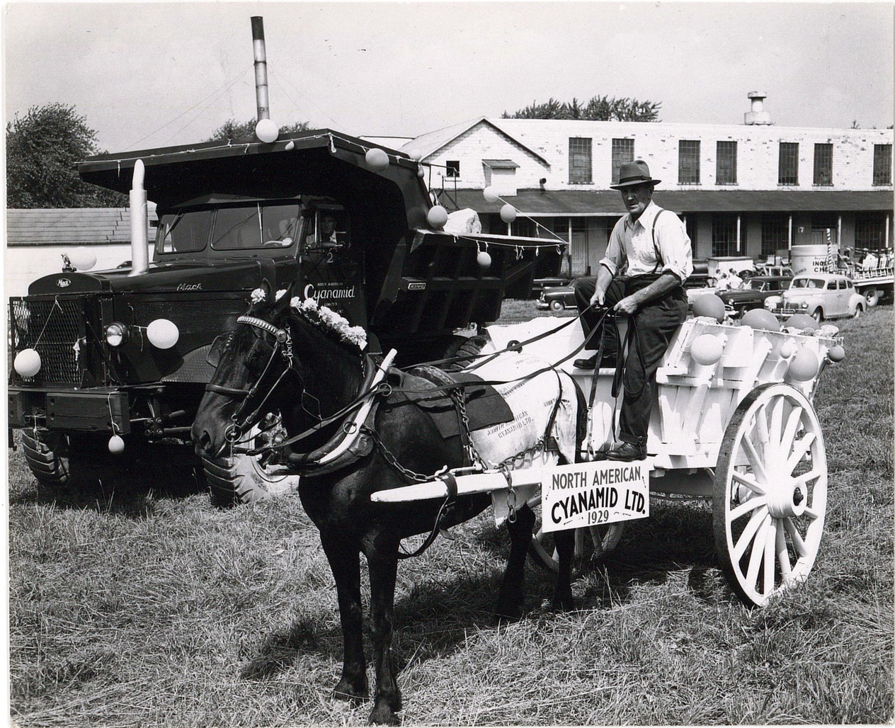
Ingersoll Centennial parade, 1952. Depicts, North American Cyanamid 1929 dump truck, as well as a horse drawn wagon assembling for the parade. Borden's Condensing plant is depicted in the background