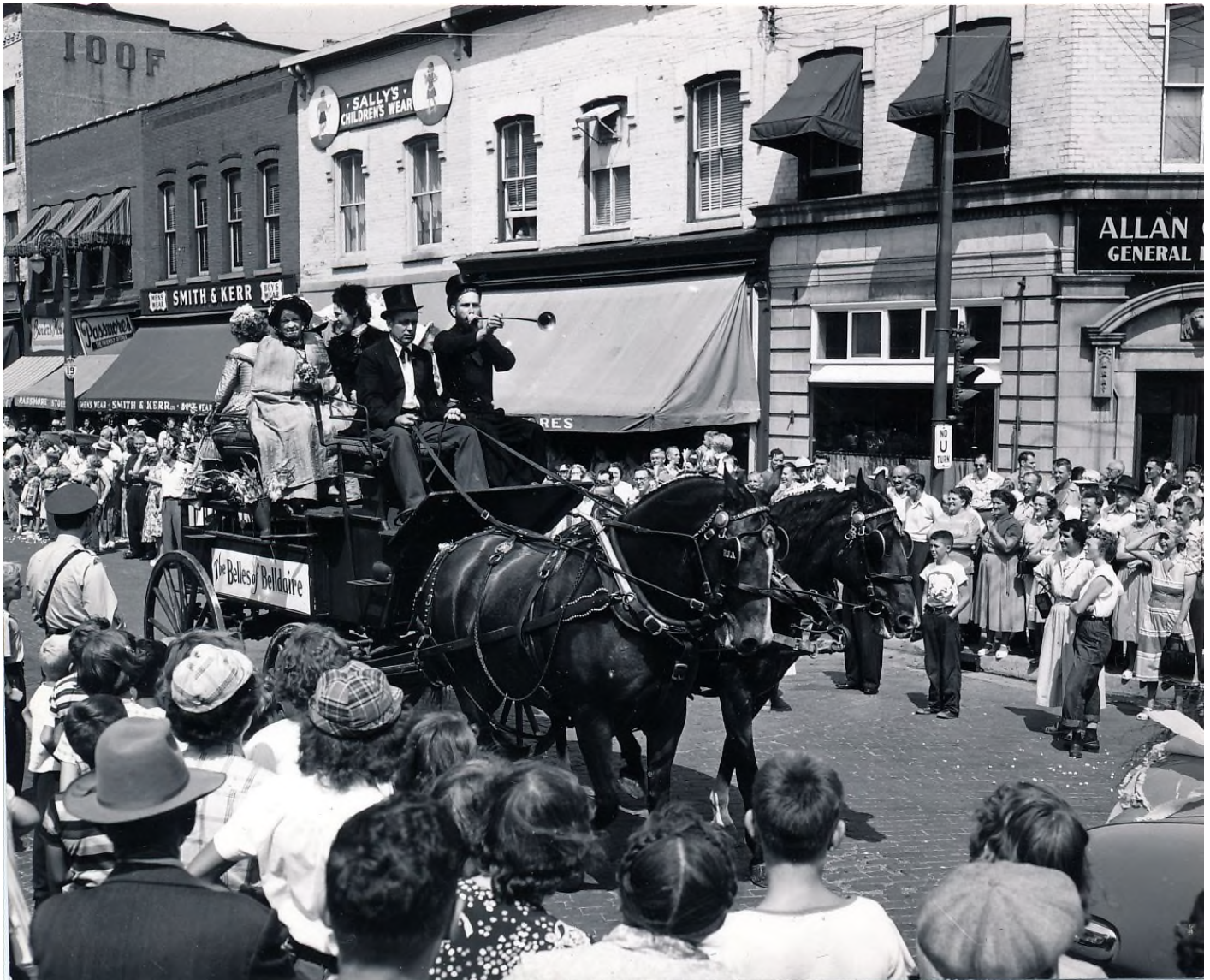
Ingersoll Centennial parade, 1952. Depicts Thames Street looking east from the corner of King Street. Belldaire Dairy horse drawn wagon float depicted with several individuals in period costume, 'The Belles of Belldaire', including trumpeter. East side of Thames streetscape including: IOOF hall; Passmore's; Smith & Kerr Clothing; Sally's Style shop; Walker stores.