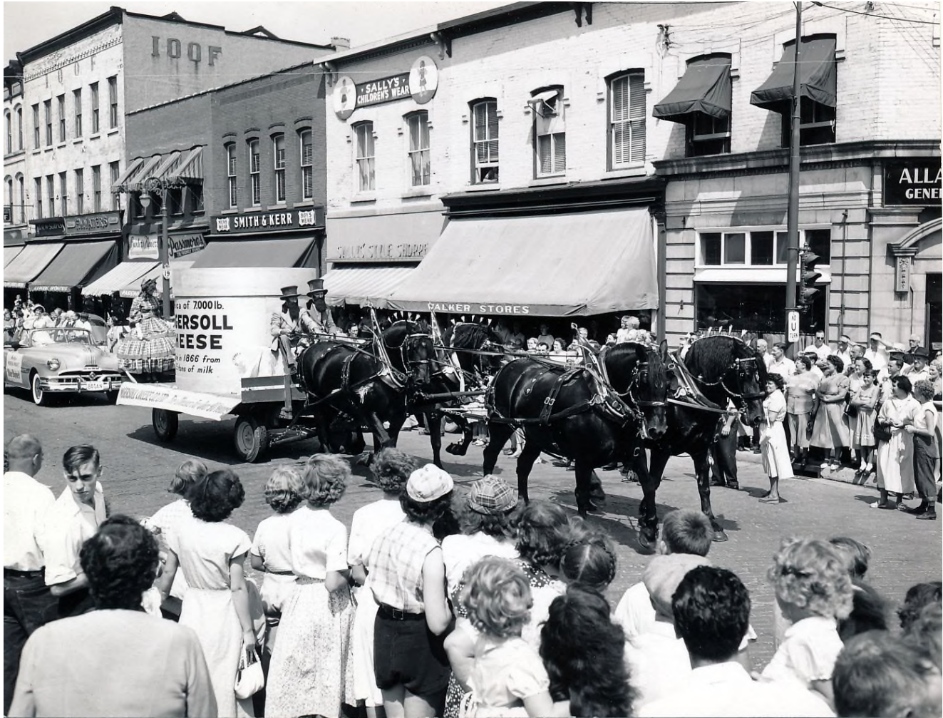
Ingersoll Centennial parade, 1952. Depicts Thames Street looking east from the corner of King Street. Replica of the Mammoth Cheese four draft horse drawn wagon float, driven by gentlemen in period costume created by Ingersoll Cheese Company, hoop skirted woman on back of float. East side of Thames streetscape including: P. T. Walker furniture; Hydro shop; Rexall drugs; IOOF hall; Passmore's; Smith & Kerr Clothing; Sally's Style shop; Walker stores. Brick paving shown.