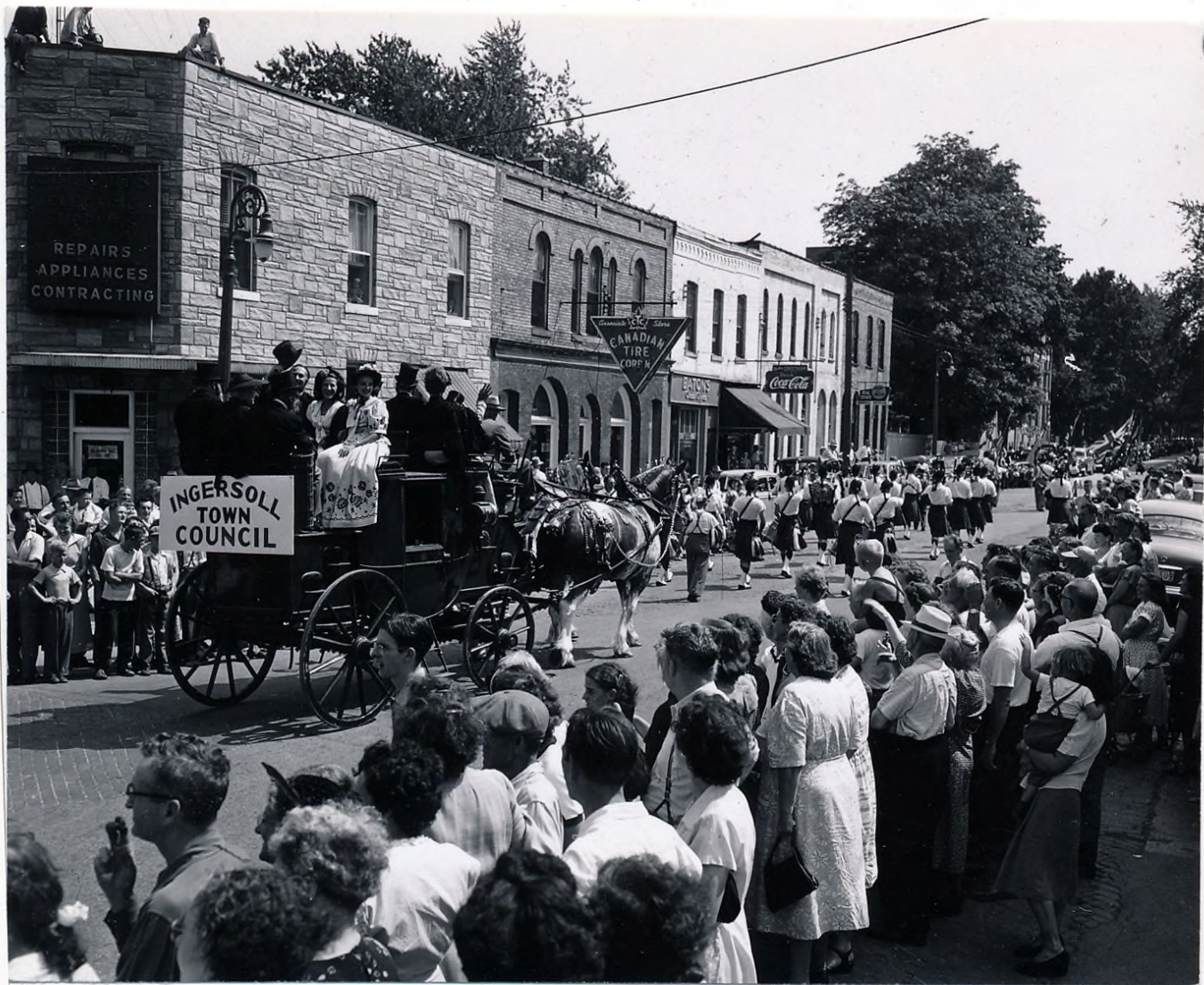
Ingersoll Centennial parade, 1952. Depicts Thames Street looking south from the corner of King Street. Depicts the Ingersoll Town Council horse drawn stagecoach parade float, Ingersoll Pipe Band. East side of Thames Street, Elliott's electric supplies, repairs, appliances, contracting; Canadian Tire store; Eaton's; James A. Cole Furniture Company and its subsidiary, the Ingersoll Casket Company. Brick street paving depicted.