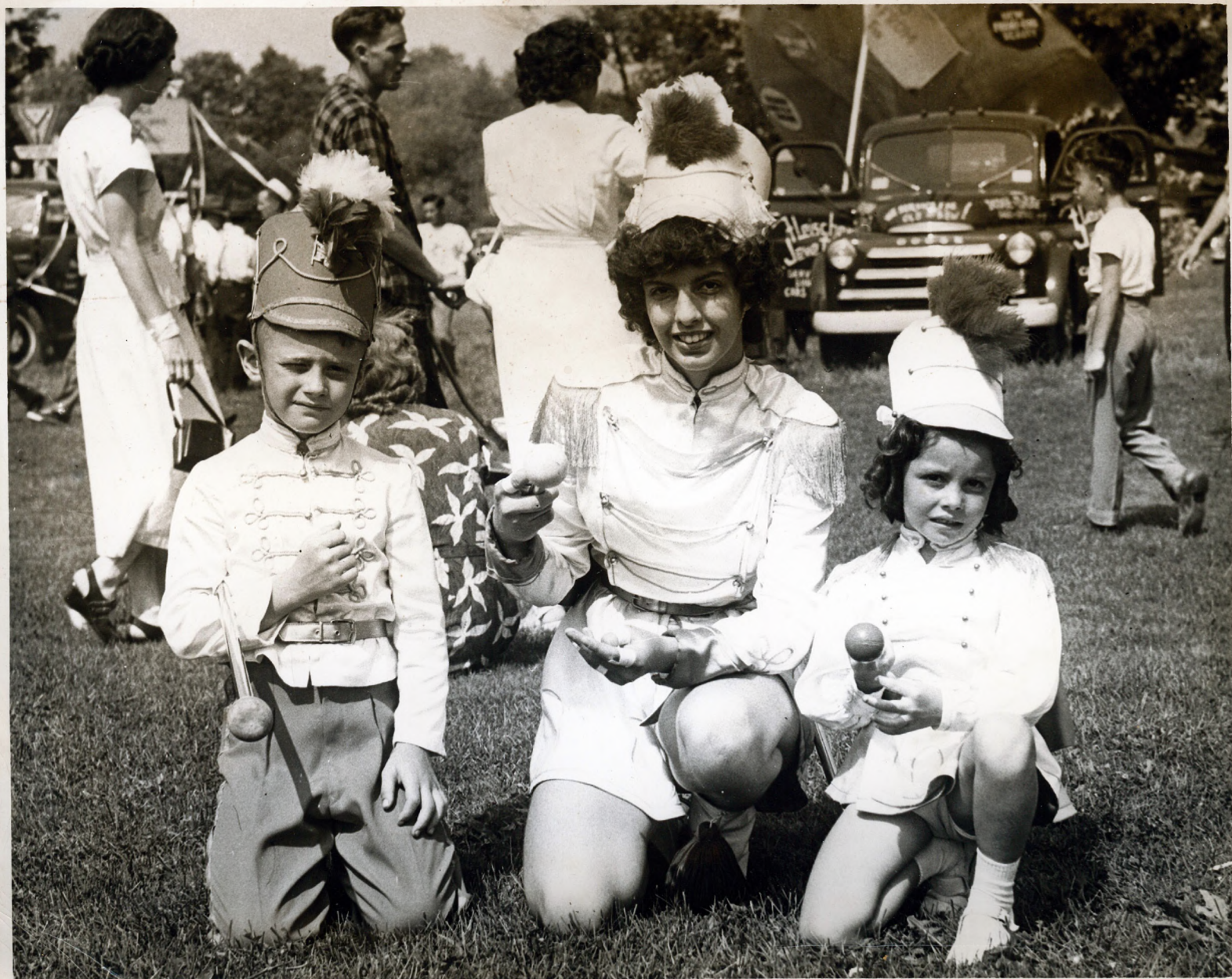
Marching band group depicted in Victoria Park during Centennial celebrations 1952. Depicted in the background is a Fleischer & Jewett Dodge truck float.