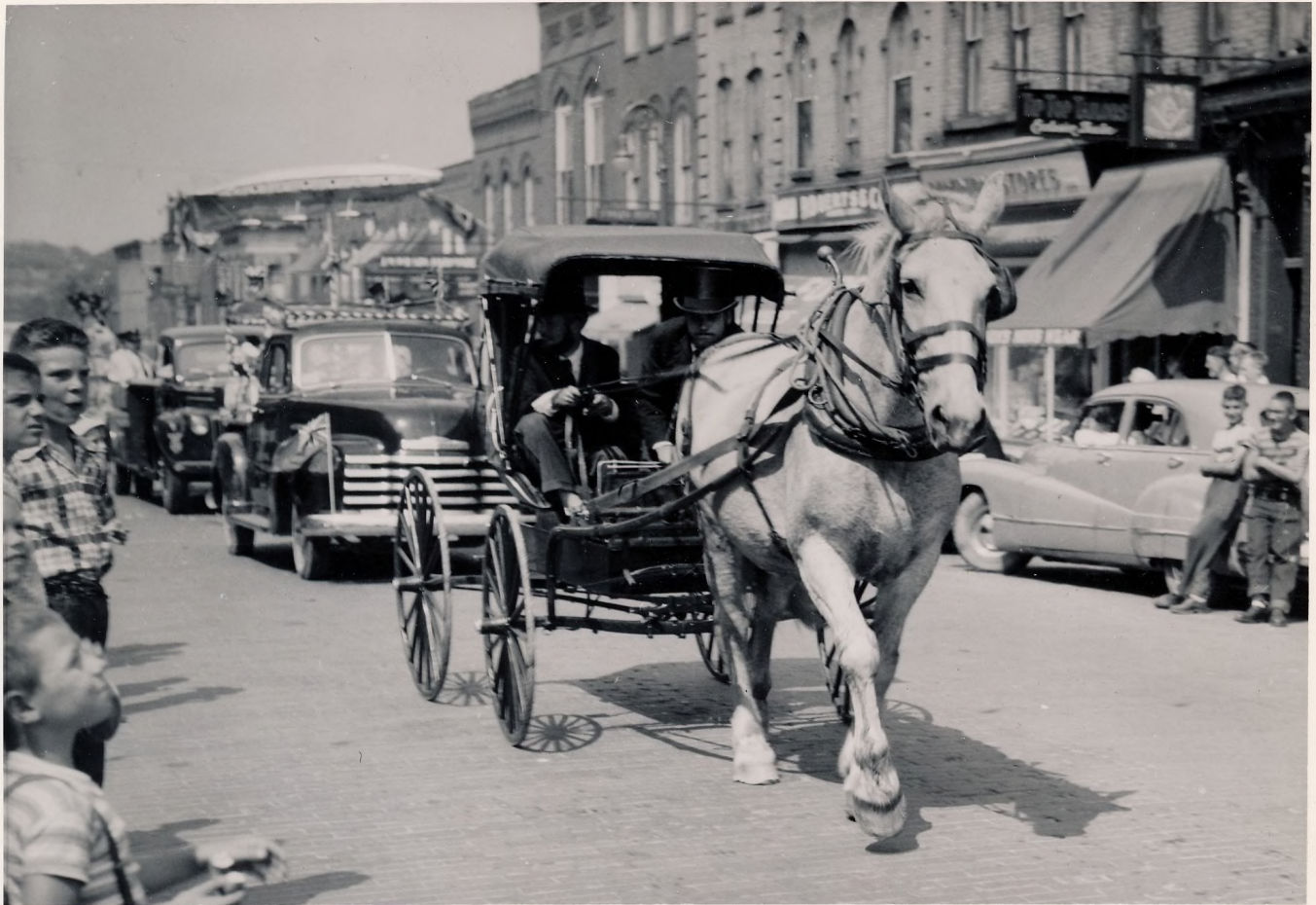
Ingersoll Centennial parade, 1952. Depicts Thames Street looking north at the corner of Charles Street. Horse drawn carriage shown. Tip Top tailors shown on the right. James D. Arnott is written on the reverse.