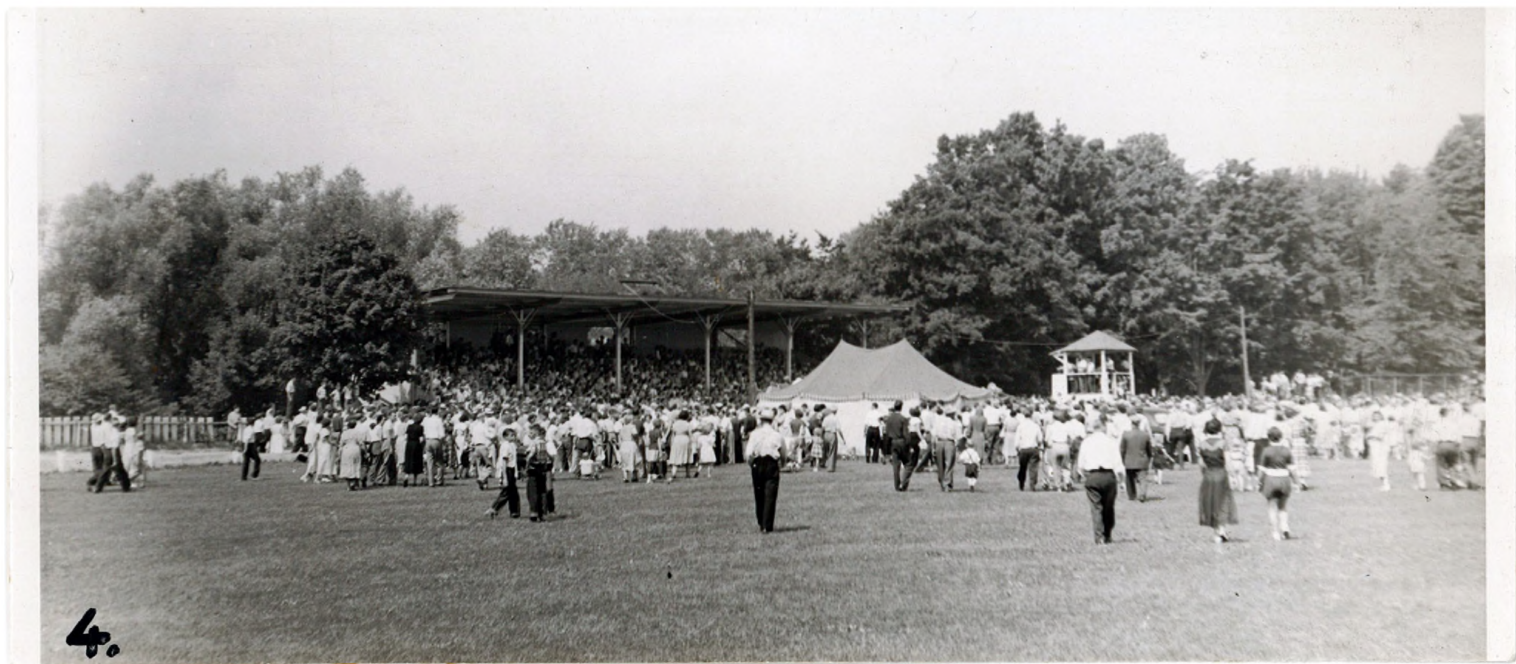
Ingersoll centennial celebrations, Victoria Park, 1952, grand stand depicted.