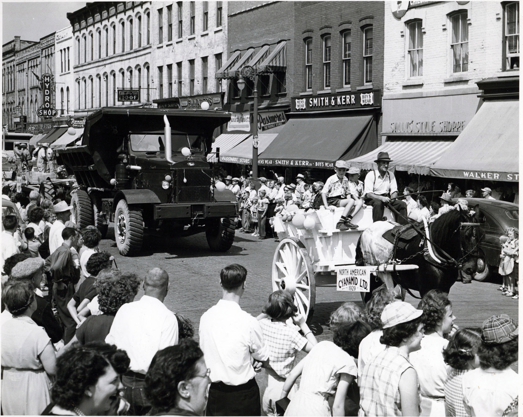
Ingersoll Centennial parade, Thames Street, east side, looking north. Depicts Hydro shop, Rexall drugs, Jack's, Agnew Surpass, Walter's Jewelry, Barter's Flowers, Passmore's Jewelry, Smith Kerr, North American Cyanamid horse drawn wagon, dump truck.