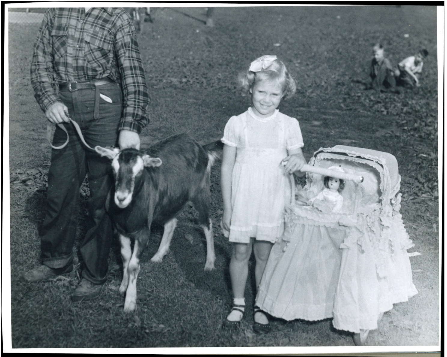
Ingersoll Centennial, 1952. Depicted man, child, goat.