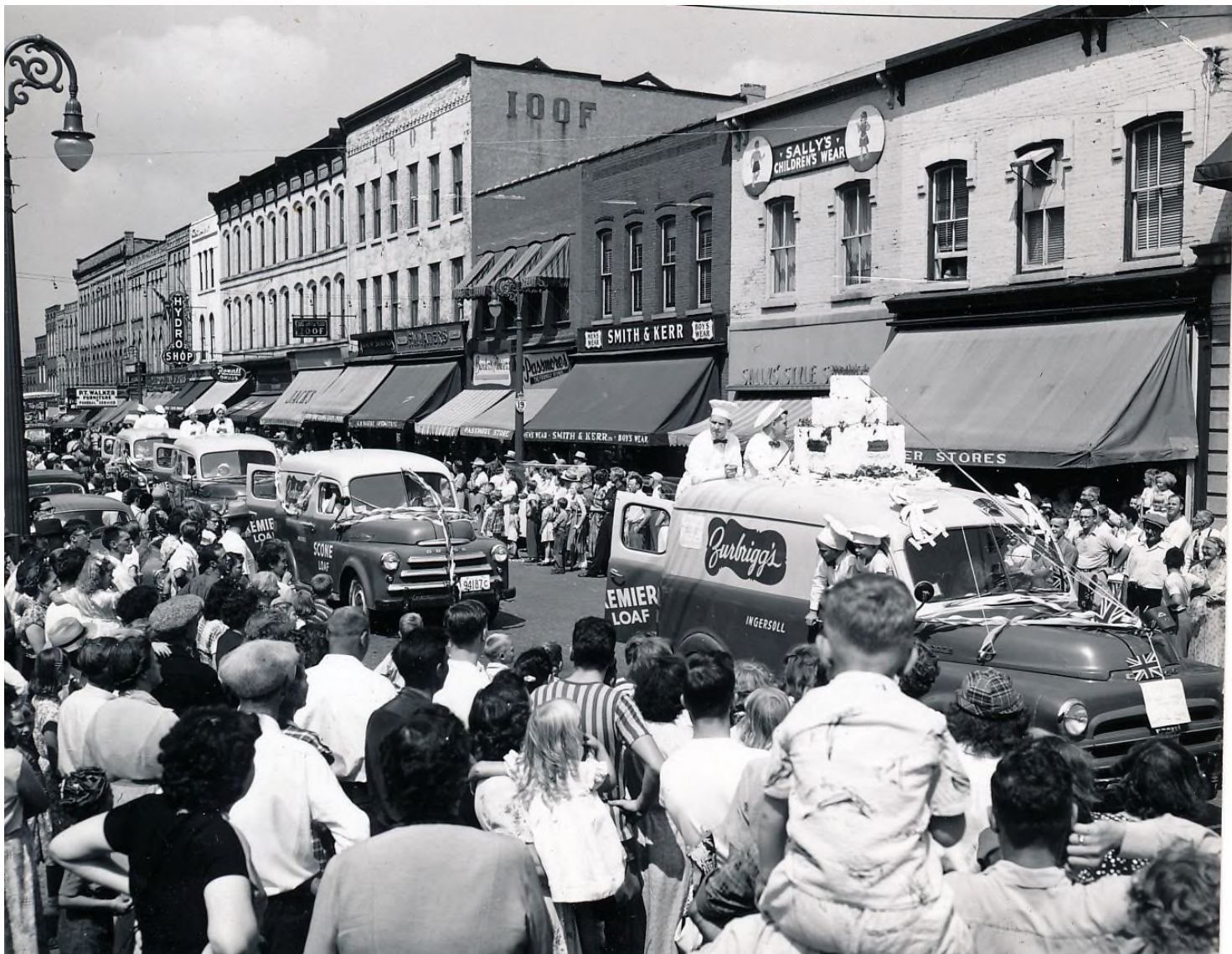
Ingersoll Centennial parade, 1952. Depicts Thames Street looking east from the corner of King Street. Four Zurbrigg's Bakery delivery vans are depicted in a row with bakers in costume perched on the rear. East side of Thames streetscape including: P. T. Walker furniture; Hydro shop; Rexall drugs; IOOF hall; Passmore's; Smith & Kerr Clothing; Sally's Style shop; Walker stores. Decorative street lights Brick paving shown.