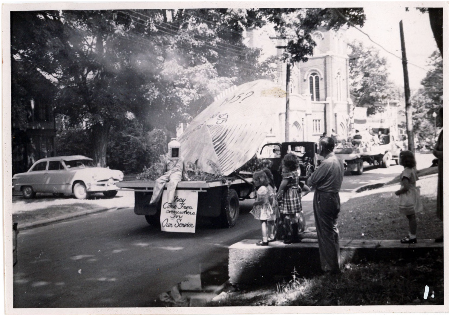
Ingersoll Centennial parade, King Street at Albert Street, looking east, 1952. Depicted: Trinity United church, parade floats.