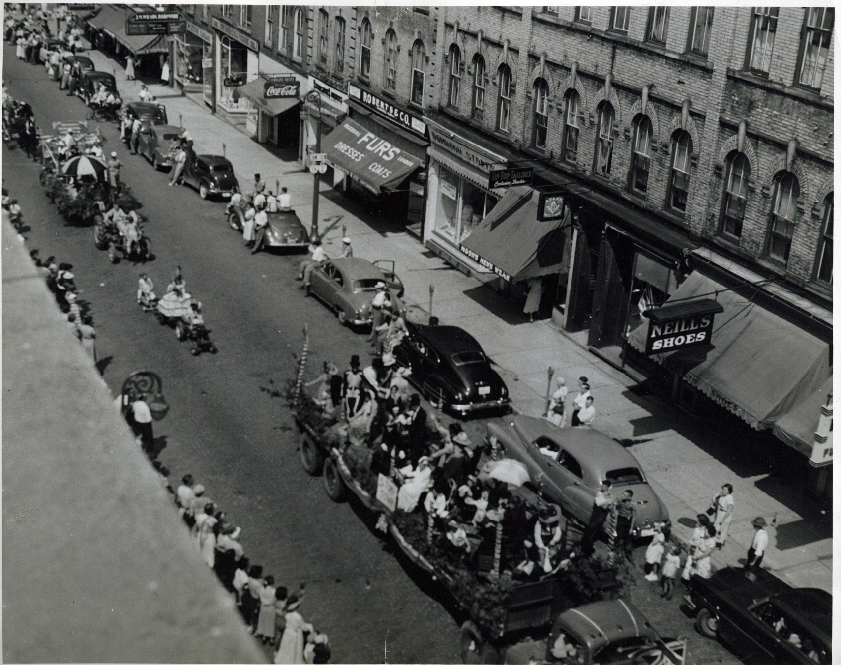
Ingersoll Centennial parade, Thames Street, 1952. Depicts Wilson's Hardware stores, Ingersoll Tribune, Sterling's Meats, Shecter's Ladies wear, Robert's Ladies wear, Featherstone's Dominion grocery store, Moon's Mens wear, Chisim's optometrist, Neill's shoes.