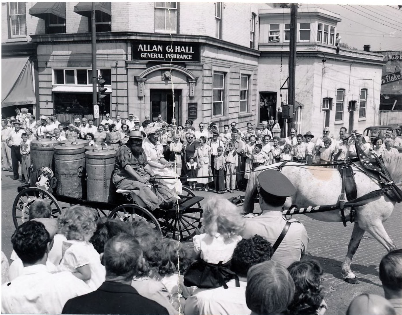
Ingersoll Centennial parade, 1952. Depicts Thames Street looking east from the corner of King Street. Borden's Company horse drawn wagon float is shown toting milk cans, individuals in period costume. Allan G. Hall General Insurance building shown, north east corner Thames & King Streets.