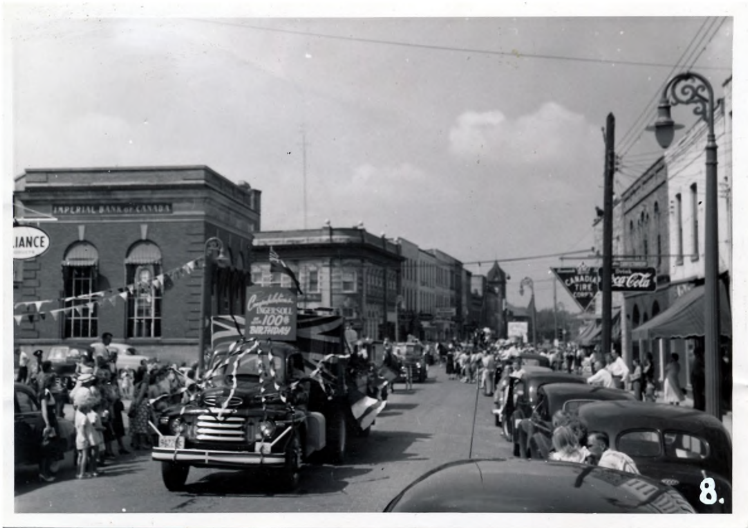
Ingersoll Centennial parade, 1952. Depicts, Thames Street, looking north at the corner of King Street. Canadian Imperial Bank of Commerce on the left, Canadian Tire store on the right.