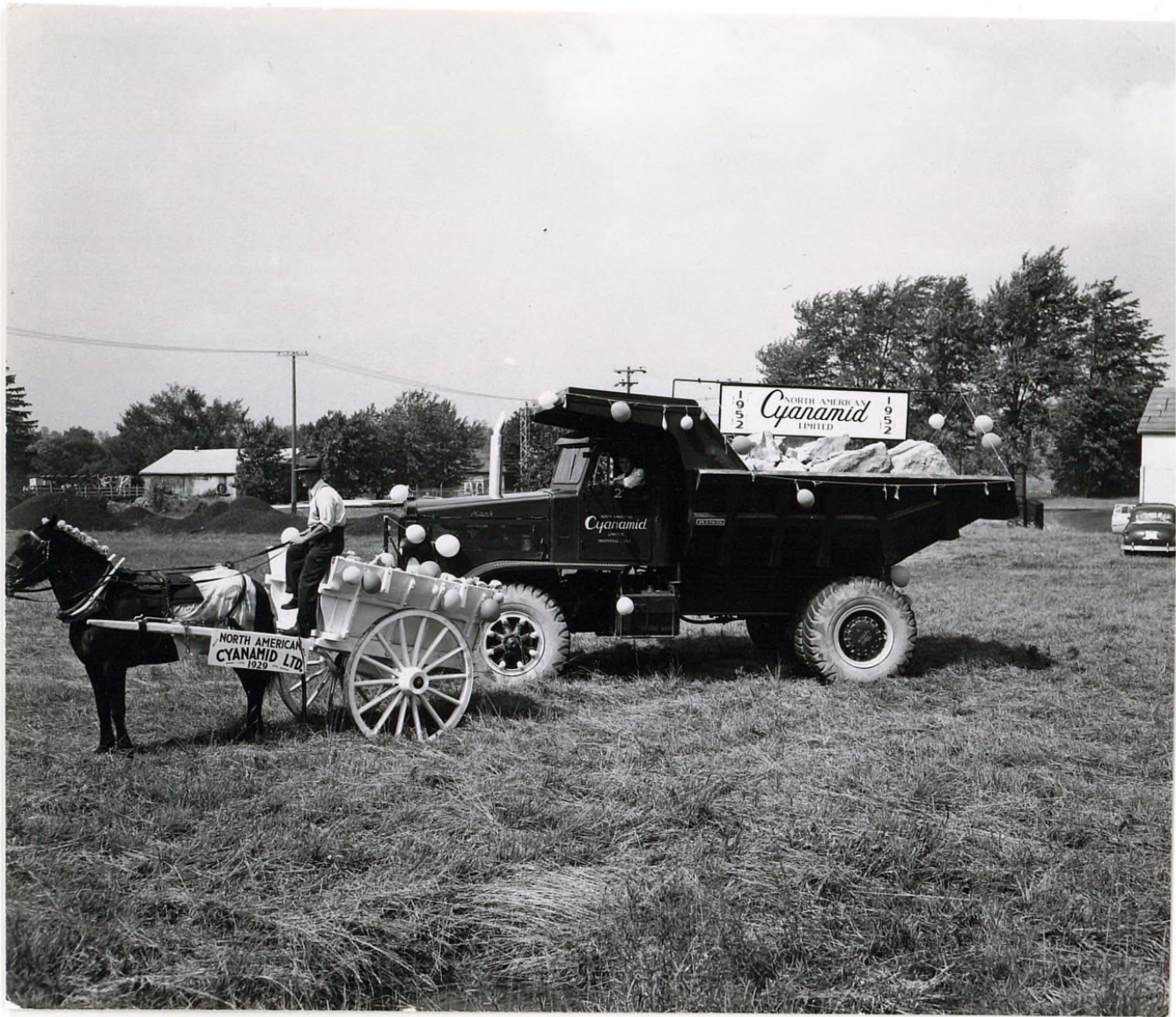
Ingersoll Centennial parade, 1952. Depicts, North American Cyanamid 1929 dump truck, as well as a horse drawn wagon assembling for the parade.