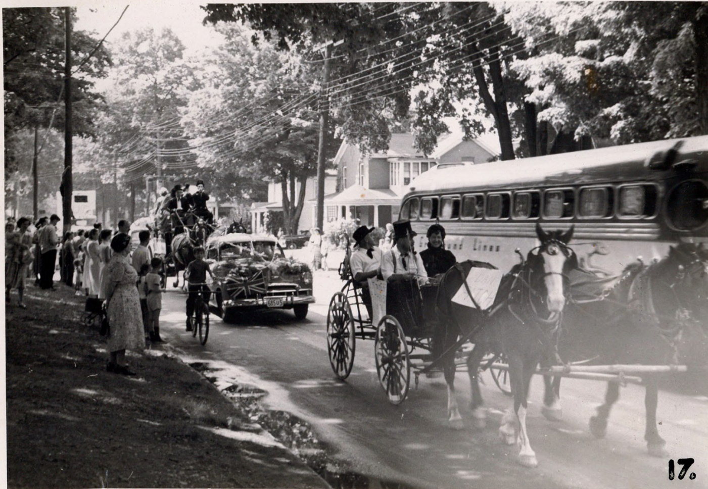
Ingersoll Centennial parade, King Street near Albert Street, looking north, 1952. Horse drawn buggys, Dan Patch, depicted.