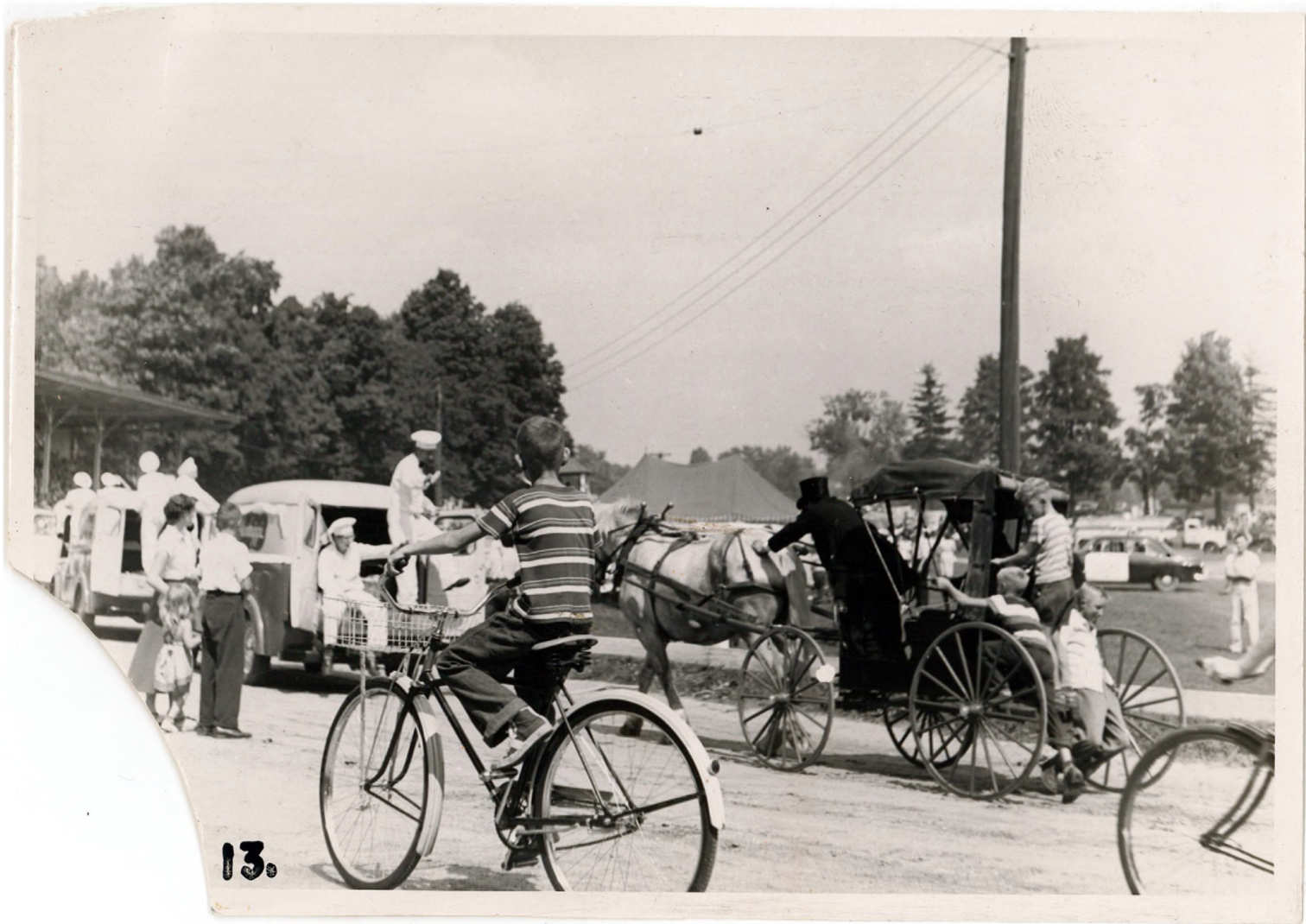
13. Ingersoll Centennial parade, Victoria Park, Zurbrigg's float shown to the right with men in baker's hats.