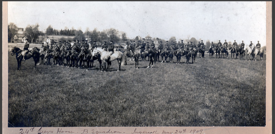
24th Grey's Horse - B Squadron - Ingersoll May 24th 1909