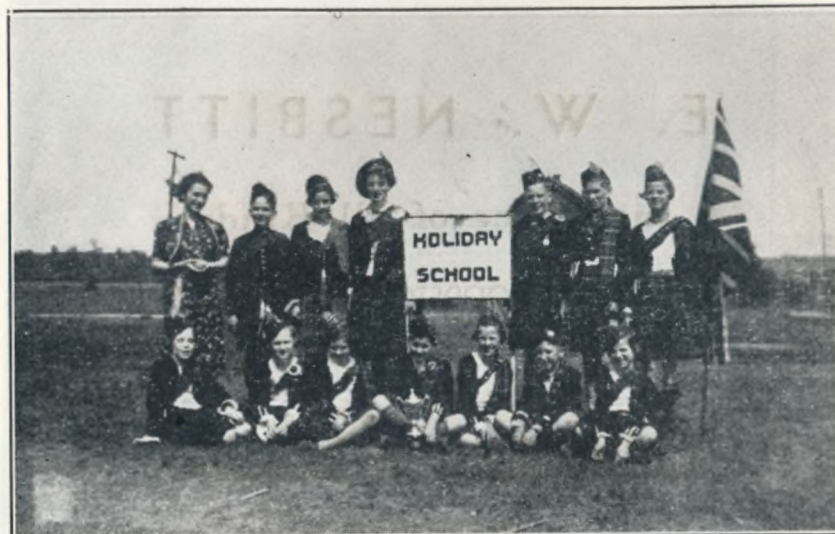
A School Entry in the Zorra Caledonian Parade of 1937