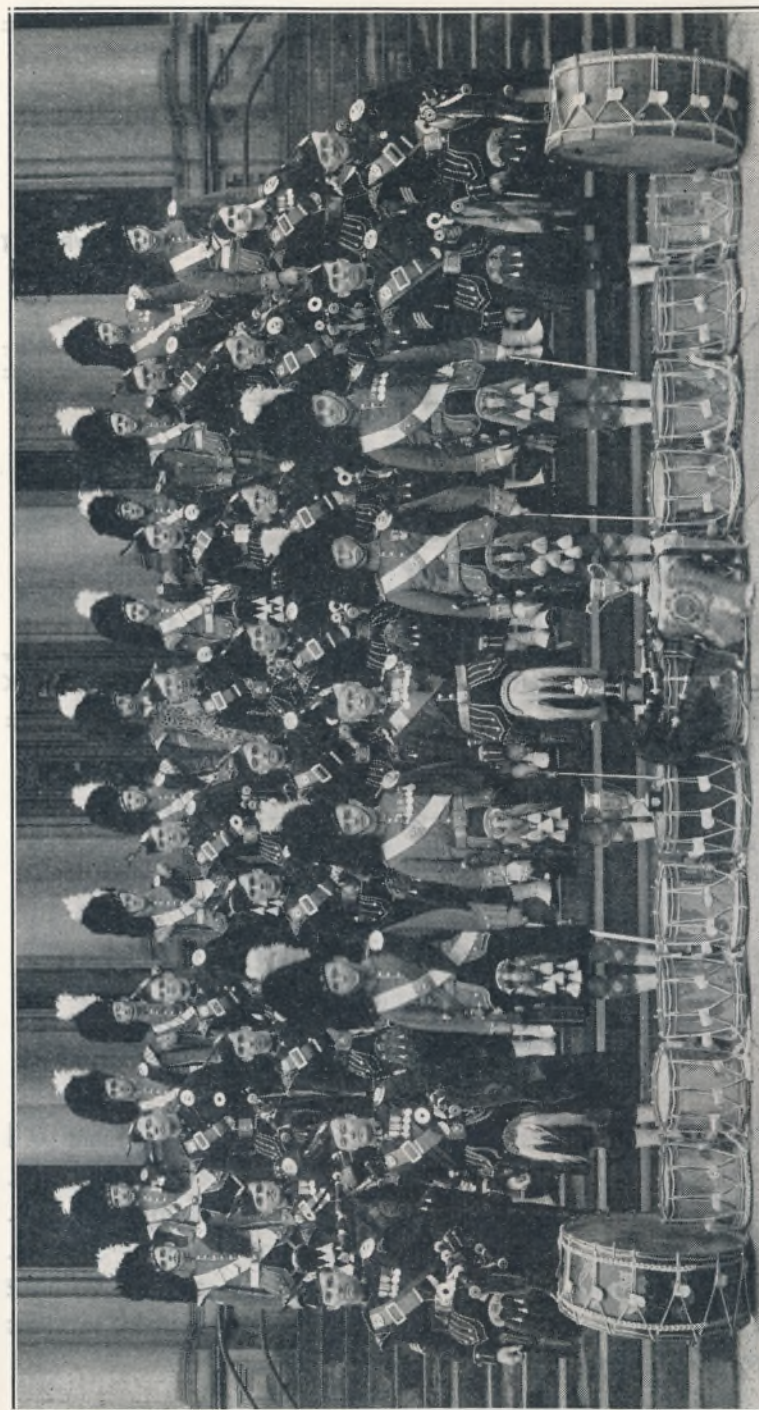
THE ARGYLE AND SUTHERLAND HIGHLANDERS PIPE BAND OF HAMILTON Winners of the Pipe Band Contest, 1937