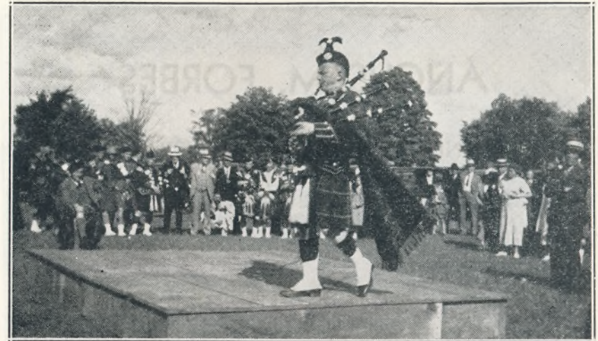
A Scene During the Piping Contest at the 1937 Zorra Caledonian Games