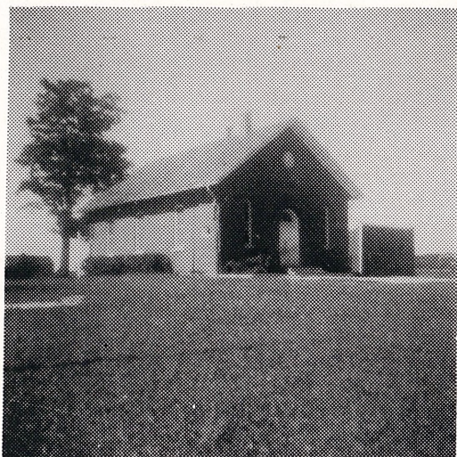
(BUILT IN 1866)