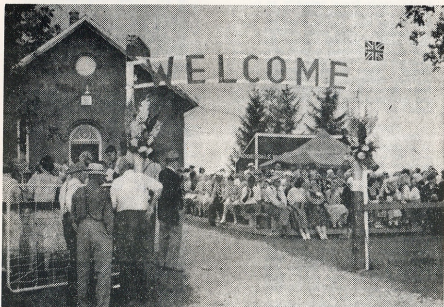
The welcome sign was hung out for the two-day reunion. Part of the crowd of 400 is shown here beside the one-room red brick schoolhouse of SS 7 West Zorra. Several pupils and one teacher who remembered the school as it stood at the turn of the century attended the event.

For nearly a century the doors of this building have opened and closed on young lives sending out threads to far corners and yet also serving to keep up its interest at home. Boys and girls, men and women, rise and salute your building, your teachers — May the spirit of the past and present mingle.